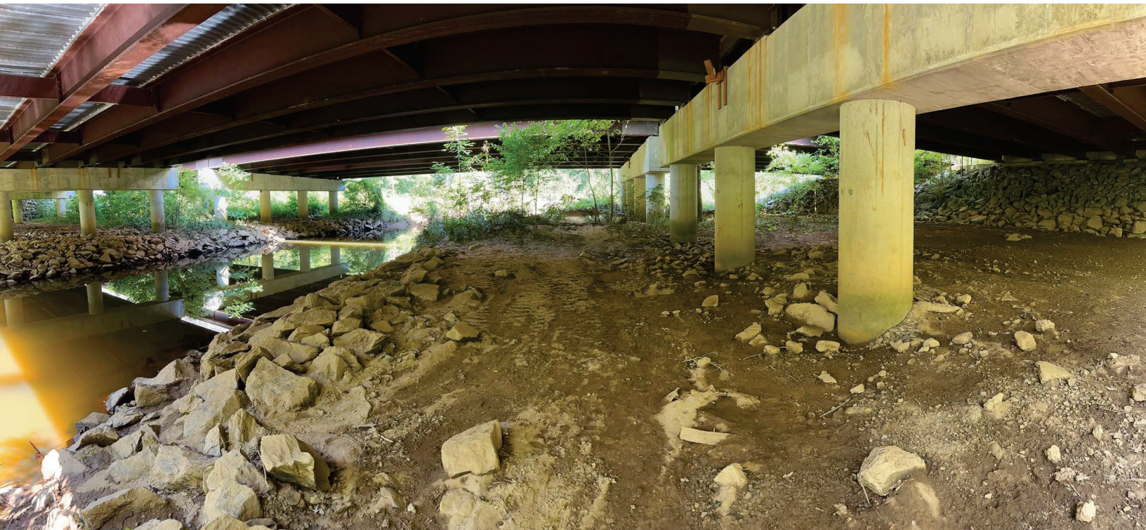
US 15-501 bridge over New Hope Creek in Durham County. DCHC MPO.