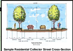
September 1, 2006